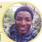
Fawibe (Pharrell), Nigeria

Enjoyable moments of ESC are numerous but all these are embedded in the uniqueness of its diversity of culture, language, and skin colour. Meeting Japanese Junior High School students under serenity of Nasu environment was memorable.