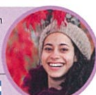
Azariah (Asa), Honduras

More than a camp is an adventure! Get ready to make new international friends and to have fun with Japanese kids!