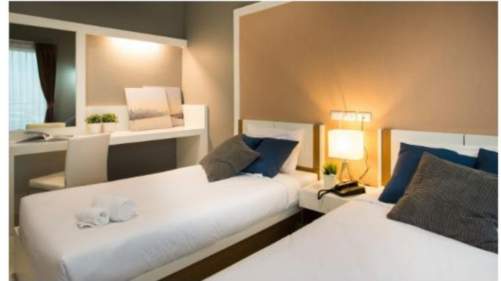
SUPERIOR ROOM - TYPE I (14TH FLOOR)

Website: https://heliconiahouse.kmutt.ac.th/